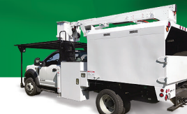
UAB | Urban Aerial Body

Heavy-Duty Chip Bodies, Tool Boxes and Aerial Packages for Tree Care Professionals