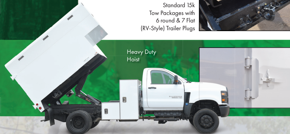
Heavy Duty Hoist