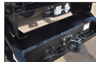
Standard 15k Tow Packages with 6 round & 7 Flat (RV-Style) Trailer Plugs