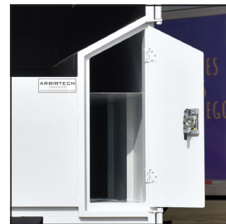
Ladder box with pole pruner shelf

Our chip bodies are available in 11', 12', 14' and 16' foot lengths along with other custom configurations offering superior quality, fit and smooth panel finish.