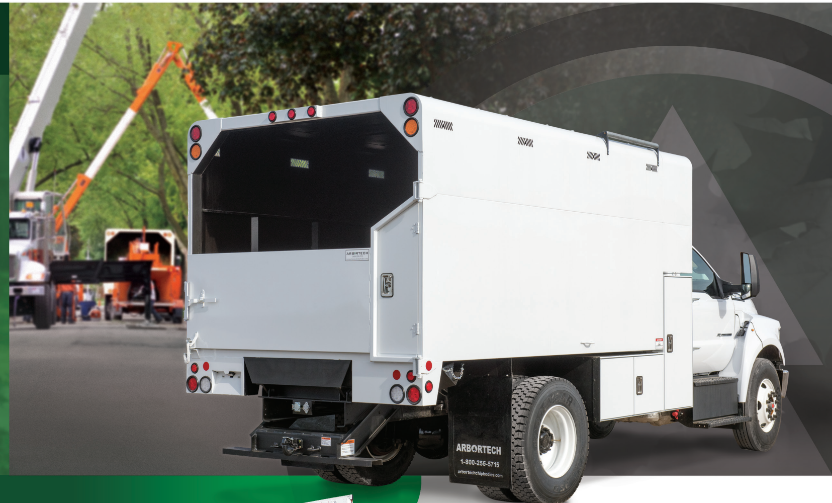
Photographs may contain optional equipment. Specifications and options are subject to change without notice.