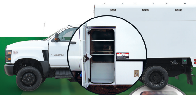
Standard reinforced door panels with durable T' locking latches

Ultra Secure Anti-Theft Tool Boxes raise the bar on security to protect your valuable tools and equipment when stored away. To learn more visit: arbortechchipbodies.com/anti-theft