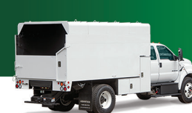
RRB | Removable Roof Body